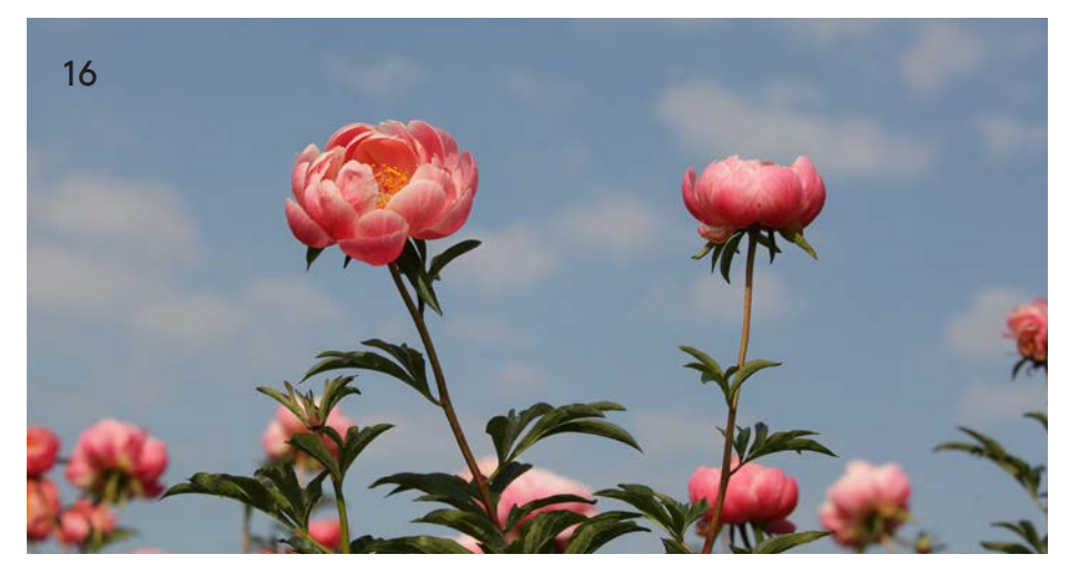
The secret of growing the perfect peony