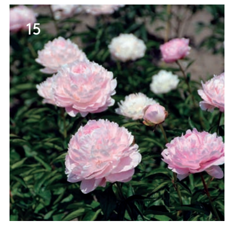
Three peonies fit for royalty