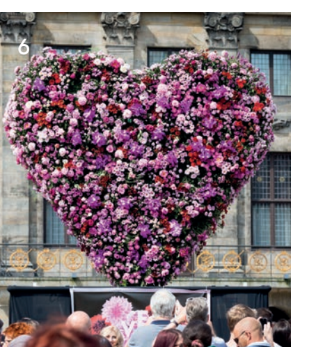
The heart of the party